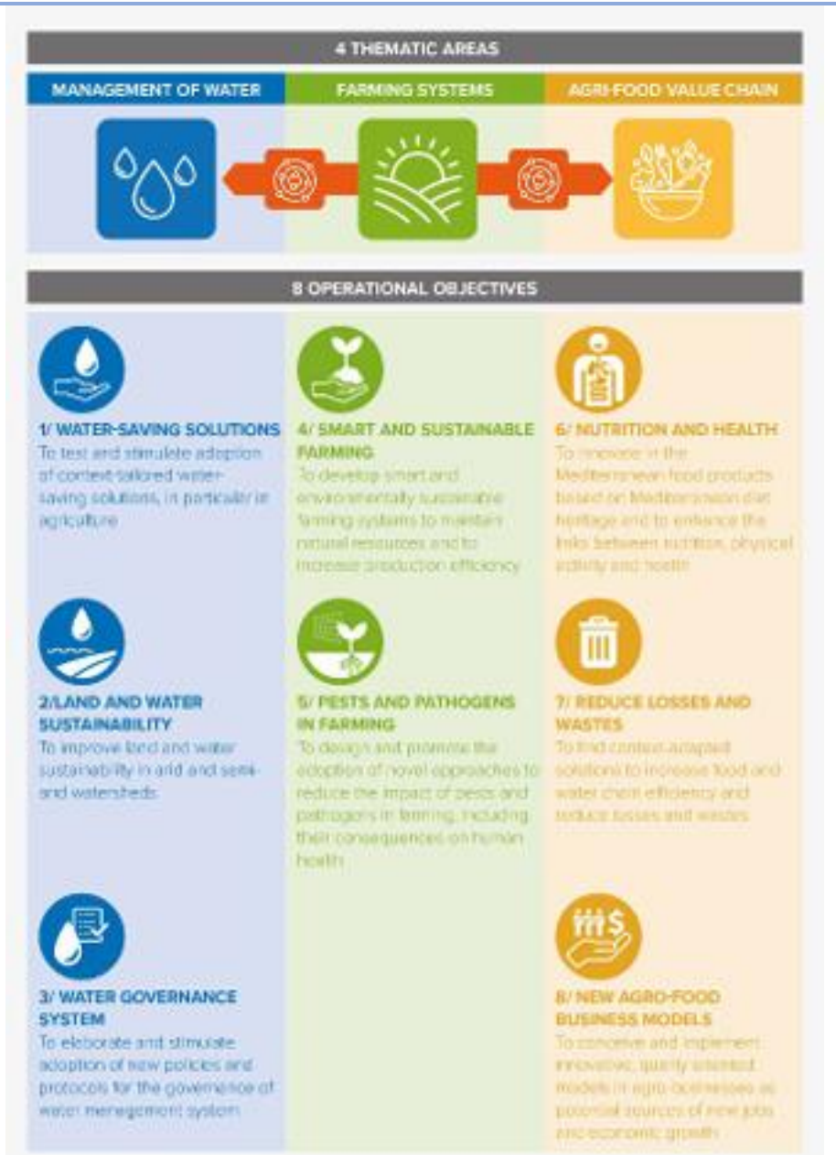
Figure 1. Operational objectives by thematic area (with a WEFE Nexus approach)

Crosscutting themes: WEFE Nexus, Soil sustainability, Digital transition, Capacity development