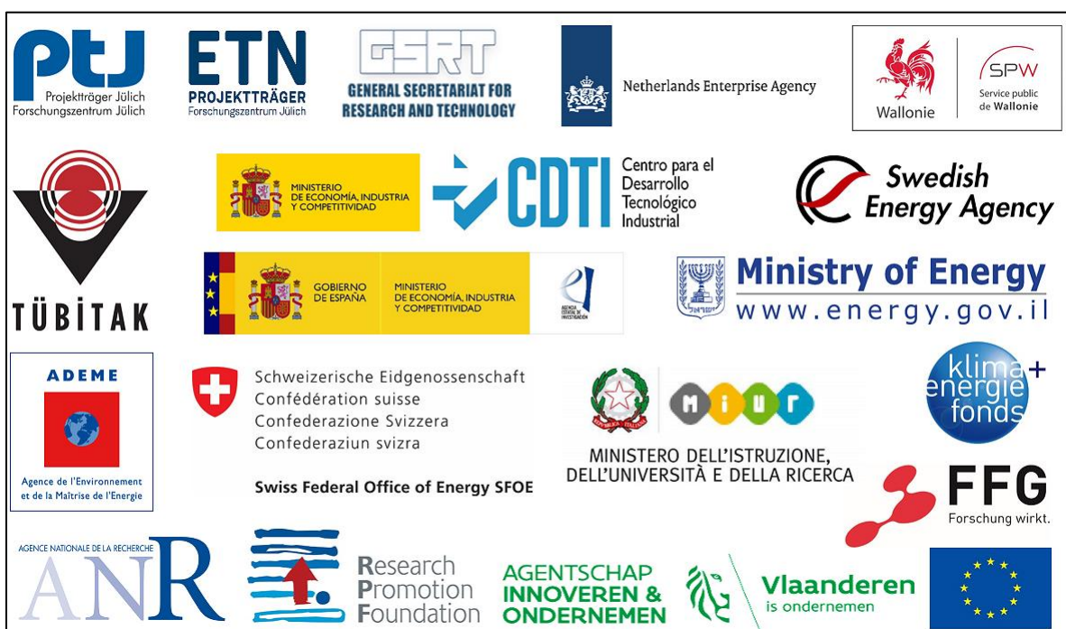
Figure 1: Organisations involved in promoting the SOLAR-ERA.NET Cofund 2 Joint Call and providing support and funding to innovative transnational projects.

The participating national SOLAR-ERA.NET partners / contact points are listed in Table 1. Each applicant have to check the project idea with the national contact point as early as possible in the preproposal phase, at the latest before submitting any applications.